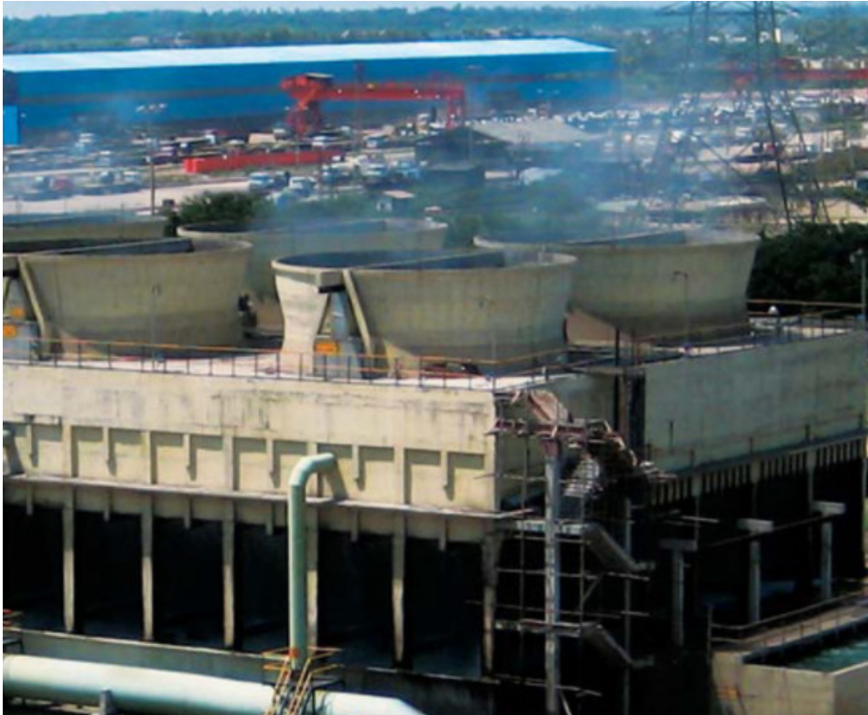
Cross flow tower

counterflow tower is about 20% smaller than the crossflow tower under the same conditions, and the heat exchange process of the counterflow tower is more reasonable and cold. 3, the water distribution system is not easy to block, the watering filler is kept clean and not easy to aging, the moisture return is small, anti-freezing ice measures are easier. Multiple units can be combined to design, and in winter, the required water temperature and water volume can be combined into a single operation or all of the fans can be stopped. 4, construction and installation is easy to repair, low cost, commonly used in air conditioning and industrial large, medium-sized cooling circulating water.